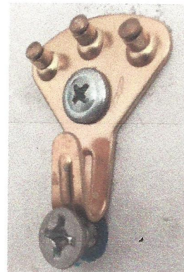
75 lb. Floreat Hanger Modified with extra screws

http://www.wingits.com/details.php?id=49