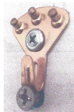
75 lb. Floreat Hanger Modified with extra screws